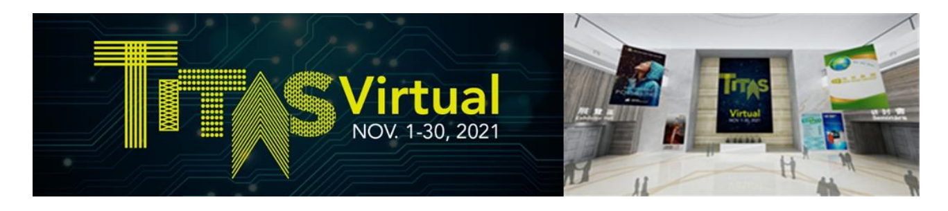
Press Release by Taiwan Textile Federation