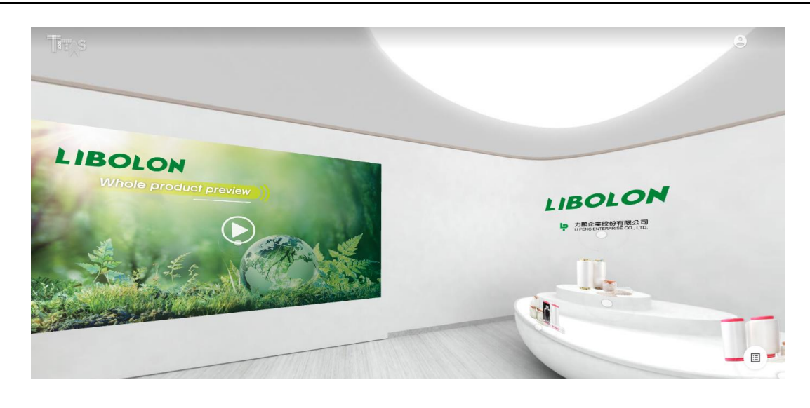
Li Peng Enterprise