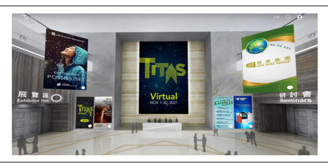
Entrance Lobby of TITS Virtual