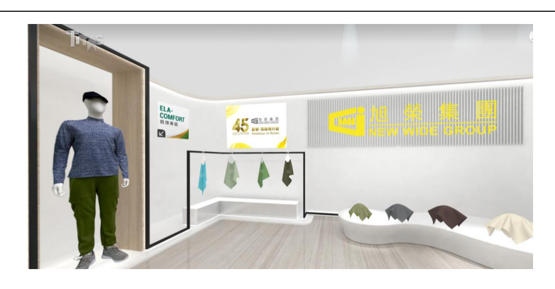
New Wide Group