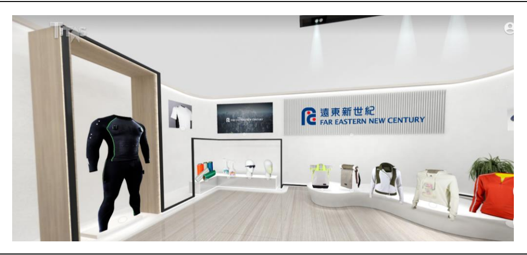
Far Eastern New Century